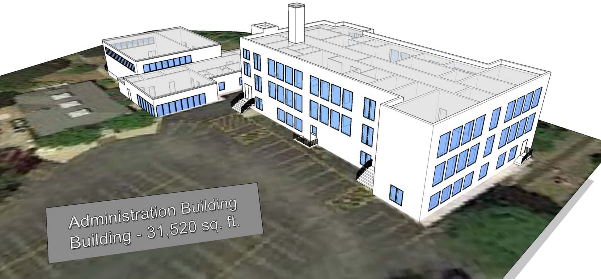
Administration Building Building - 31,520 sq. ft.